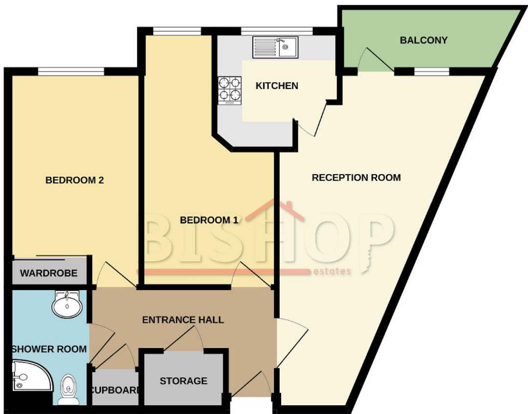
2 BEDROOM 1 BATHROOM FIRST FLOOR APARTMENT

Whilst every attempt has been made to ensure the accuracy of the floorplan contained here, measurements of doors, windows, rooms and any other items are approximate and no responsibility is taken for any error, omission or mis-statement. This plan is for illustrative purposes only and should be used as such by any prospective purchaser. The services, systems and appliances shown have not been tested and no guarantee as to their operability or efficiency can be given. Made with Metropix ©2023